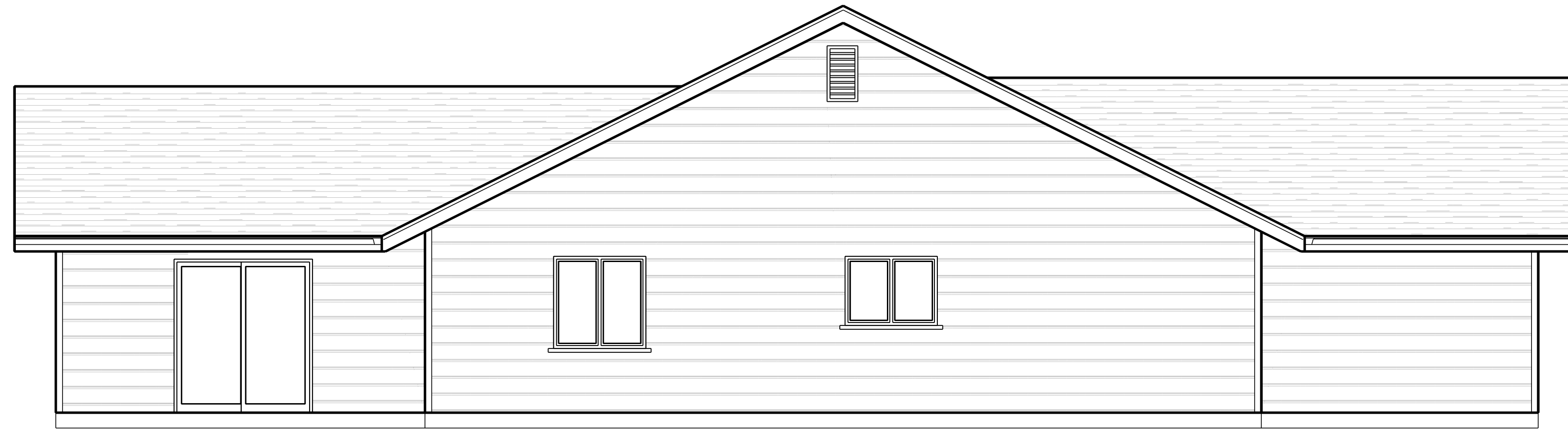
NORTH ELEVATION SCALE: 1/4" = 1'-0"