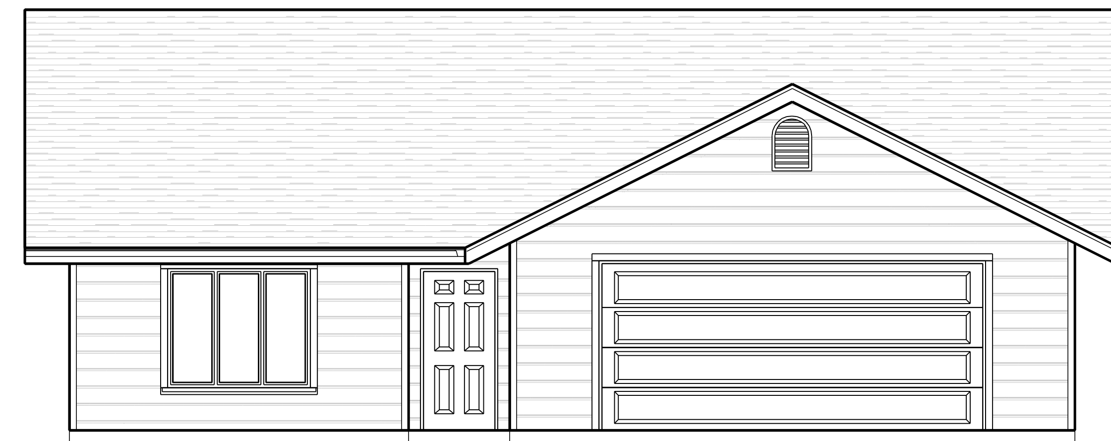
WEST ELEVATION SCALE: 1/4" = 1'-0"